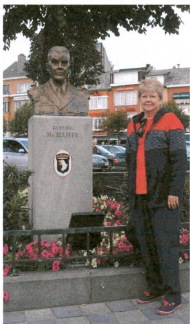
Photo of the McAuliffe statue in Bastogne. I was privileged to visit along with many others on the 60 th Anniversary tour of Holland.

The end of World War II marked the beginning of an intermittent existence for the 101 st – several in-activations occurred during the next two decades. Official reactivation ceremonies were held on 21 September 1956, making the 101 st the Army's first Pentomic division. (author unknown)