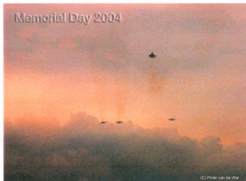
Right: The missing man fly-over at the 2004 Memorial Day ceremony at the Margraten Cemetery , Holland. More than 8,000 people attended.