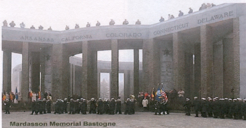
Mardasson Memorial Bastogne