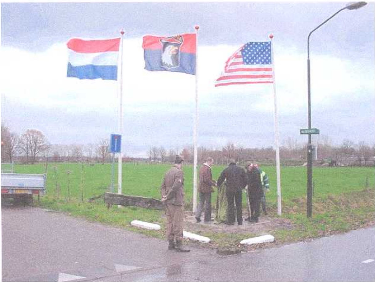
2006: Monument site at the intersection of roadway to Wolfswinkel and Hell's Highway 2 miles North of Son. . Cemetery location is to the left.