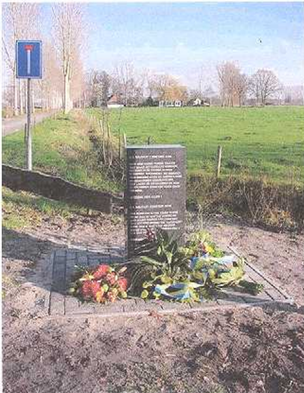
Left Below: The cemetery location is beyond the Waterhoef farm and house in the background.