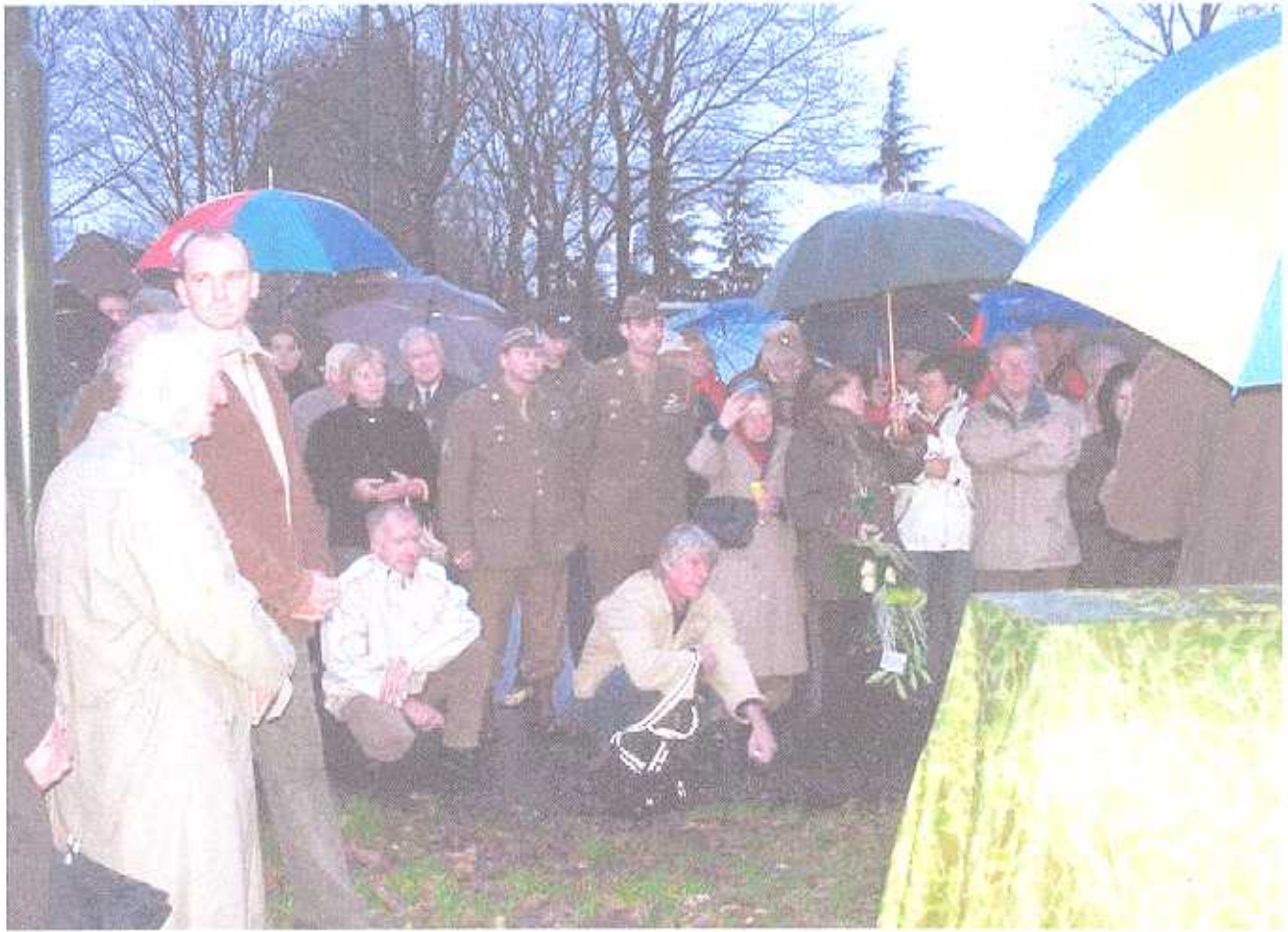
Part of the crowd at the dedication of the monument Friday, December 8, 2006, Son, The Netherlands