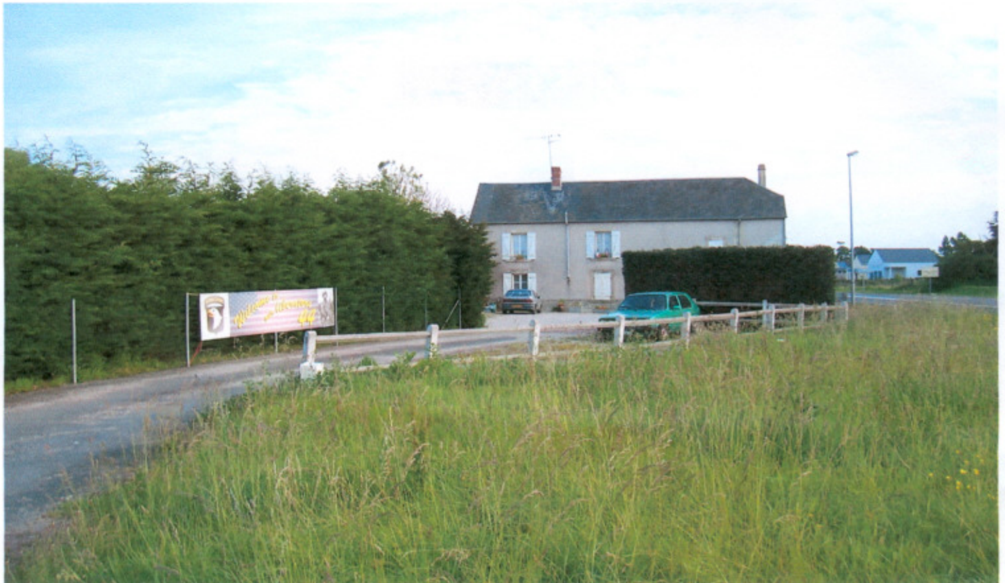
from the Ingouf Farm, Normandy - June 2007