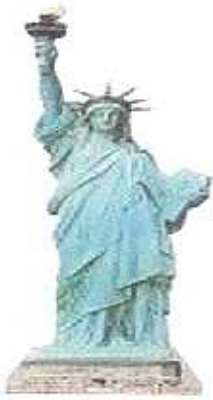
Statue of Liberty