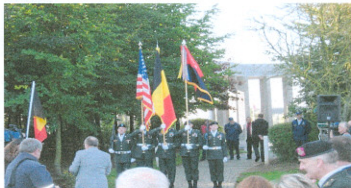
The Ft Campbell, KY Color Guard Inauguration of the 101 st Air Memorial & Attached Units Bastogne - Sept 2011, 2018

Mardasson Monument. Friday was a good day, very chilly but dry. Nice ceremony and the Ft Campbell KY Color Guard was