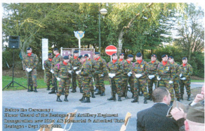
Below the Ceremony : Honor Guard of the Bastogne 101 st Artillery Regiment Inauguration of the 101 st Air Memorial & Attached Units Bastogne - Sept 2011, 2018

Below: The color guard of the Artillery group of Bastogne gather before the dedication ceremony.