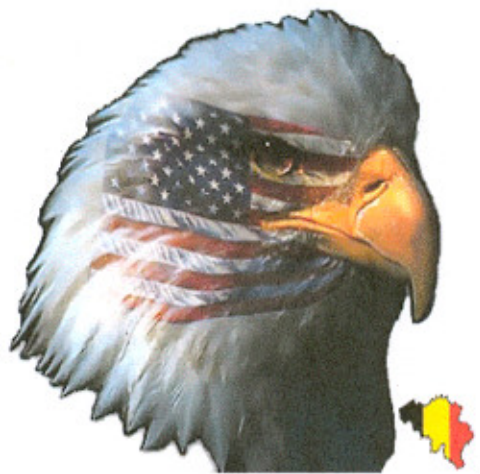
European Center Military History, Jilray, Belgium

This guy is 86 years old and loves to fish. He was sitting in his boat the other day when he heard a voice say, 'Pick me up.' He looked around and couldn't see any one. He thought he was dreaming when he heard the voice say again, 'Pick me up.' He looked in the water and there, floating on the top, was a frog.