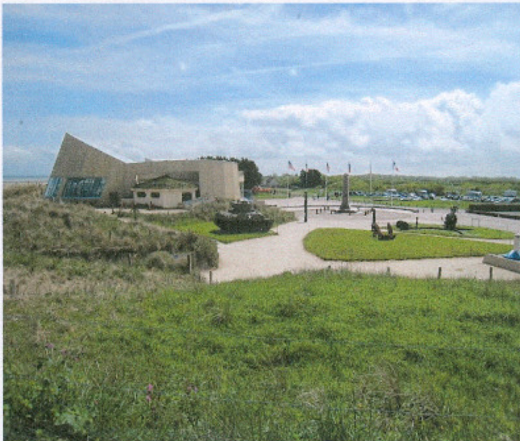
(left) Utah Beach with Museum