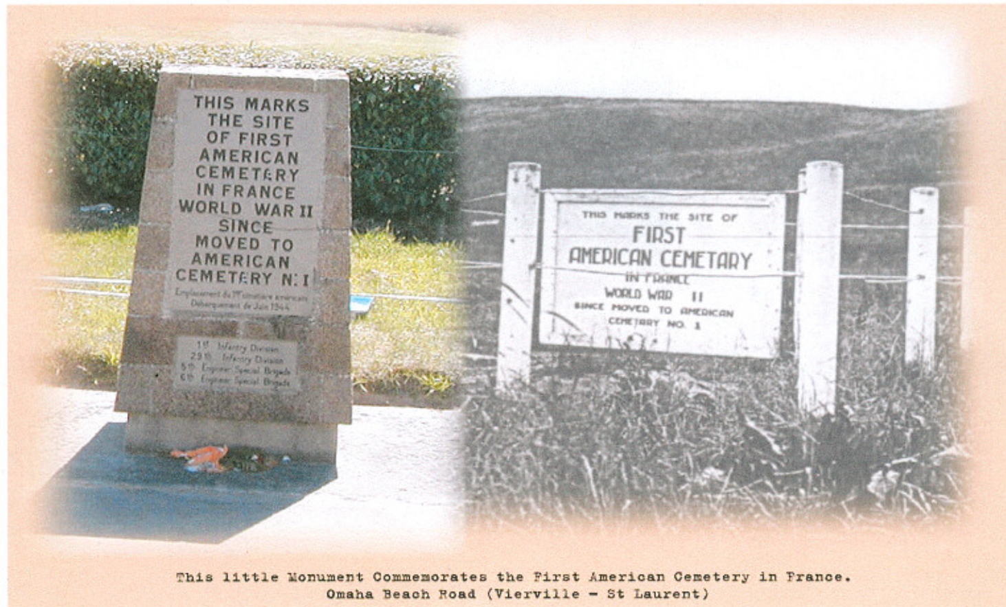
This little Monument Commemorates the First American Cemetery in France. Omaha Beach Road (Vierville - St Laurent)

Now and Then Photos: Marker of The first American Cemetery, France NOW THEN