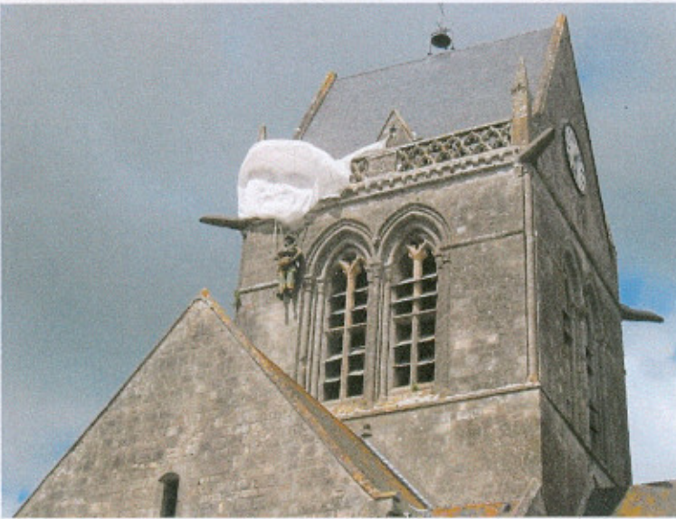
(left) St. Mere Eglise